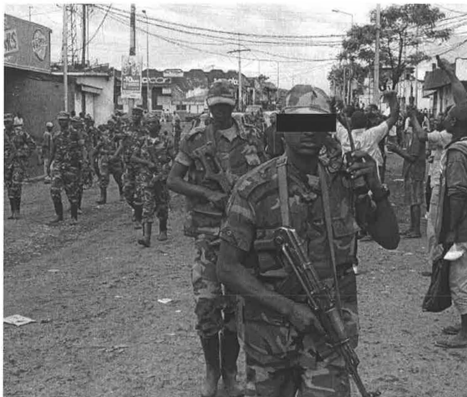
Photo of M23 soldiers arriving to Goma wearing RDF uniforms.